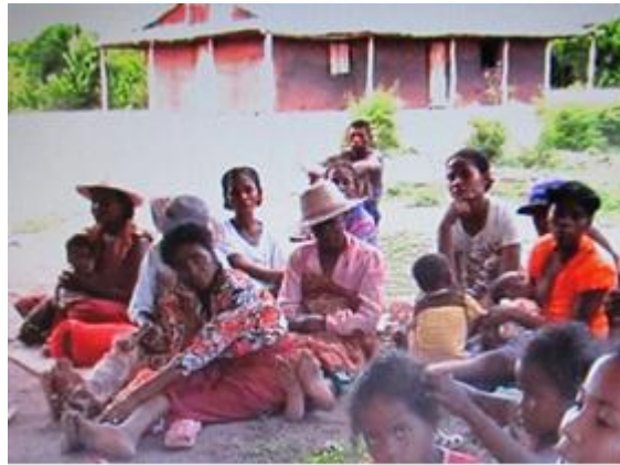
Figure 2: Village meeting in Sakanay