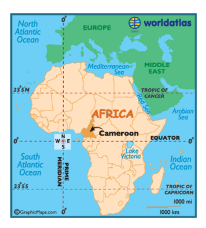
Fig. 1. Map of Africa, showing the position of Cameroon

Cameroon is a country in the west Central African region, boarded by Nigeria to the west; Chad to the northeast; Central African Republic to the eash; and Equatorial Guinea, Gabon, and the Republic of Congo, to the south. Cameroon's coastline is part of the Gulf of Guinea and the Atlantic Ocean. Due to its geological and cultural diversity, and to the fact that Cameroon exhibits all major climates and vegetation of the continent, the county is often referred to as "Africa in miniature". Natural features include beaches, deserts, mountains, rainforest, and savannas. Mount Cameroon is the highest point, and it is located in Buea in the South West Region. Douala is the largest city and the economic capital, while Yaounde is the political capital (source: http://www.enwikipedia.org).