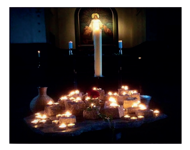
Figure 9: After the praying session – the center of the church room with lit candles (Photo: Carl Petter Opsahl).

to the center. The pastors are the leaders of the services, but by their placement of the materiality the center is opened for people at the margins. As such, the center becomes a place for collective interaction .