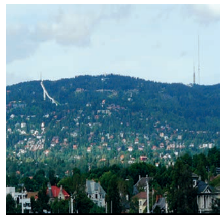
Figure 1: Center and periphery. On the left, the view from my office in Ecuador; on the right, the view from the Norwegian School of Theology.