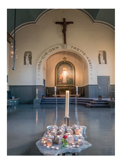
Figure 8: Pictures of Tøyen kirken, Oslo. On the left, an official picture from 1969<sup>40</sup>, and on the right, the same church today.

In the picture on the right, we see another ordering of the materiality in the same church. The church benches are placed to the side, and in the middle of the floor we find a space for collective prayer, normally with a microphone for praying. The center is moved from the front to a place where every person during the service is invited to pray and light candles. When I observed the service, peoples' stories expressed through prayers became the center of the liturgy.