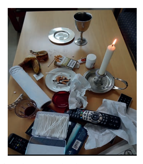
Figure 10: Picture from a home visit with Holy Communion, reconstructed. ^{43}