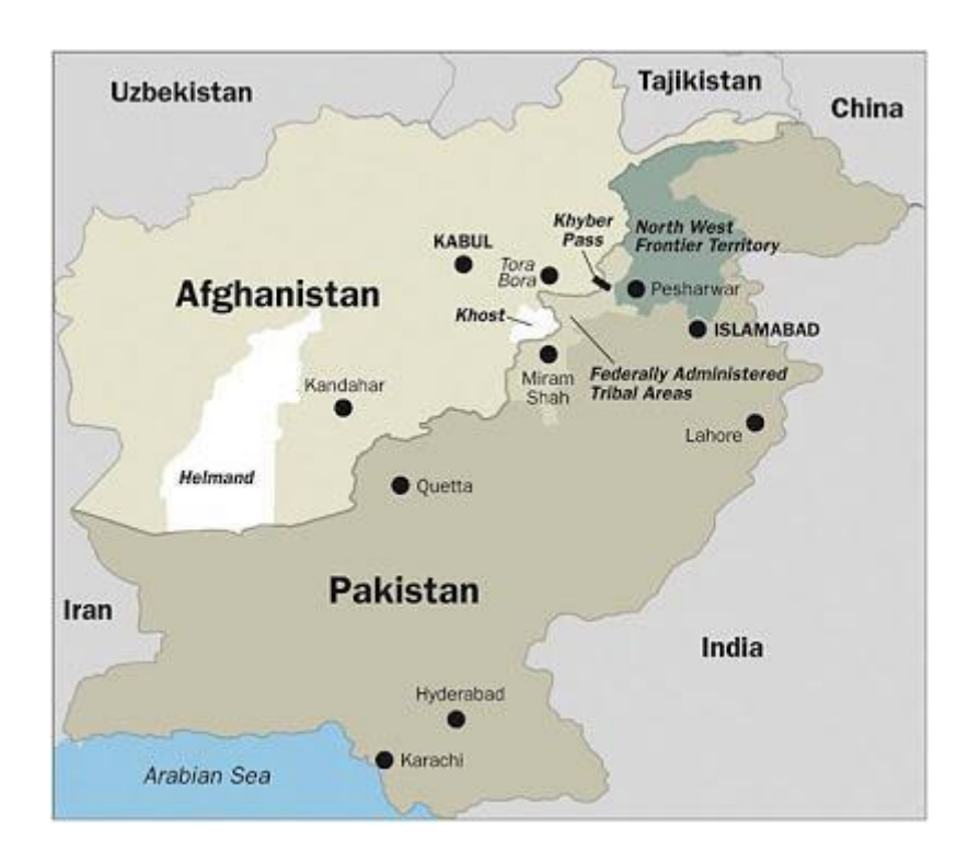
Figure 1 (Geographical and Geostrategic Importance of Pakistan in Global Perspective, 2020)

Pakistan lies between latitudes 24 and 37 degrees north. Pakistan's lowest point is its Indian Ocean coast, at sea level. The highest point is K2, the world's second-tallest mountain, at 8,611 meters (28,251 feet). There are flat Indus plain in east, mountains exist in the northwest, Balochistan plateau is situated in west (Kureshy, 1976, p.7)