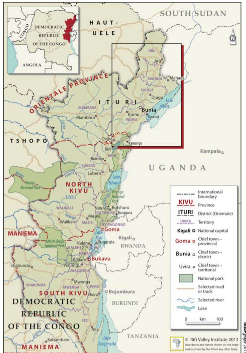
Map of Eastern Democratic Republic of Congo (DRC).

By talking to representatives of the various church networks it becomes evident that these provincial centres represent the pivotal political scale of church politics, forming coordinating nodes where the internal relations within particular church networks as well as