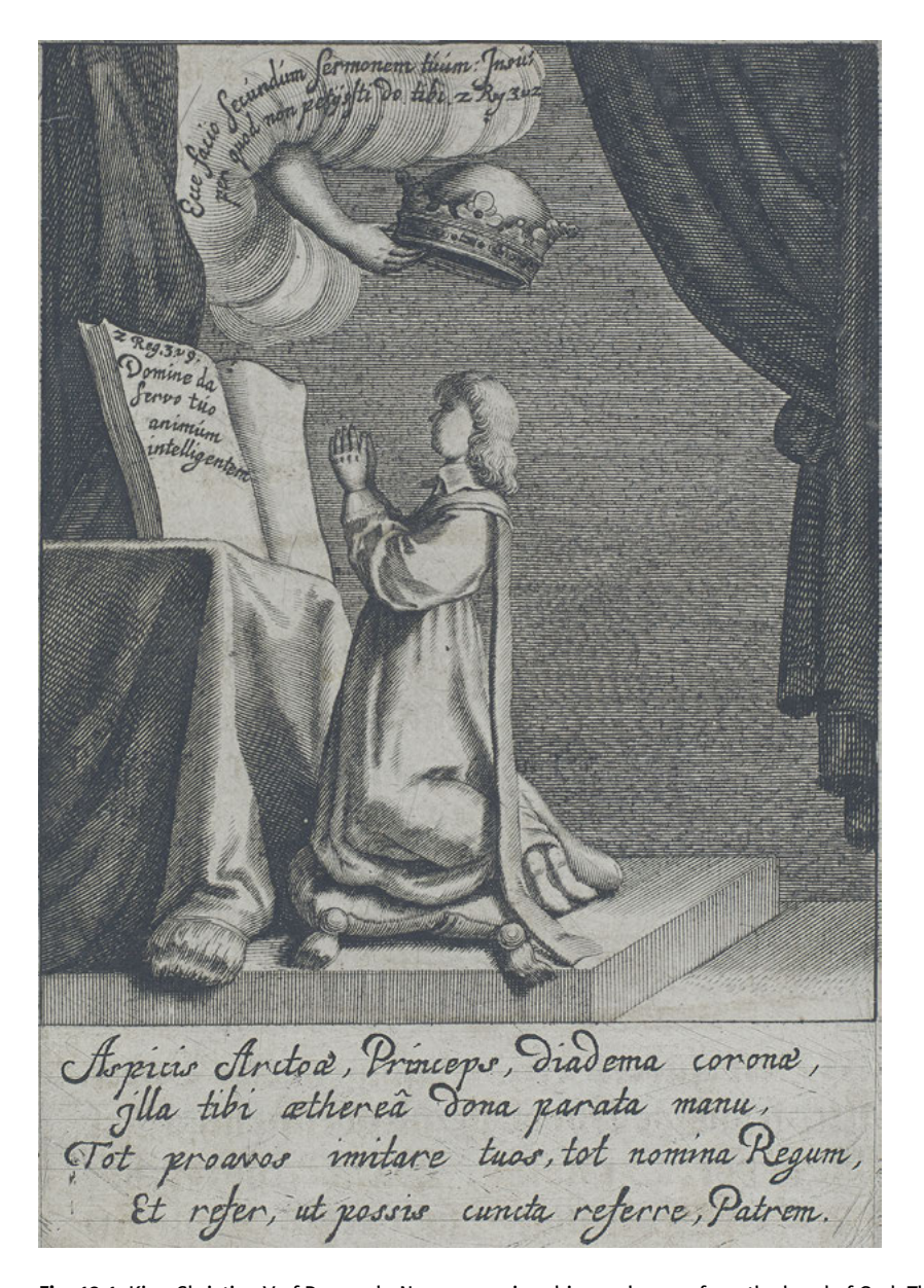
Fig. 19.1: King Christian V of Denmark–Norway receives his royal crown from the hand of God. The open bible on the altar quotes 1 Kgs 3:9: "Give therefore thy servant an understanding heart", or, as the engraver has it, "an intelligent soul" [animum intelligentem]. Engraving, late seventeenth-century.