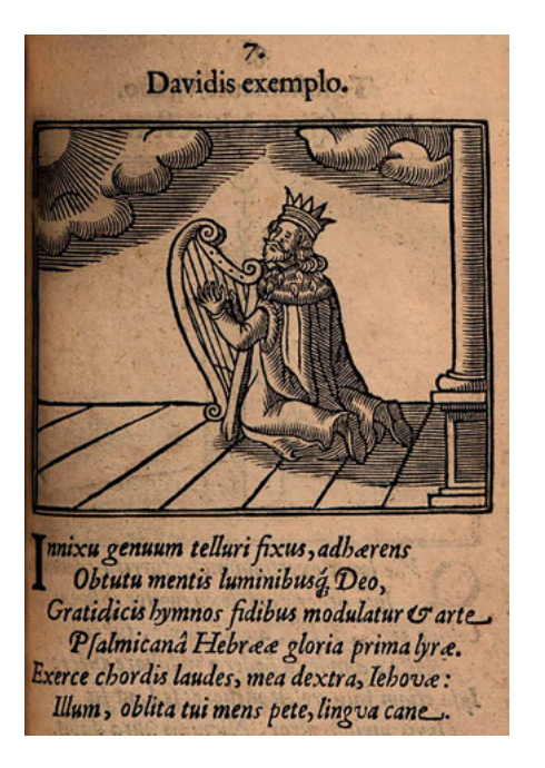
Fig. 19.3: According to Westhov, a good king should follow the example of the biblical King David: fall on his knees and contemplate the lights of God. Above all, the king should offer hymns. Woodcut from Willich Westhov, Emblemata, 1640, fol. 7.

understanding of a threatening chaos reflected a basic cultural assessment. The optimistic mood that had formed the first years of Reformation in Denmark–Norway gave way to a religiosity that can be characterized as penitential .<sup>39</sup> Already King Christian IV, who reigned until 1648, promoted the sorrow and grief of a particular deficiency: good deeds as the fruits of faith. 40