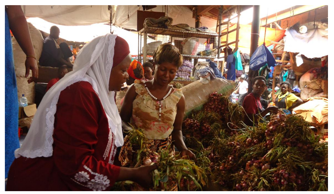
Photo 4 showing a Muslim customer buying onions from a Christian vendor at Owino Market in Kampala Central (Dialogue of Life).

This is when people of different religions meet to discuss or experience different aspects of life. It takes place in all ordinary interactions and inter-relations between people of different religions without a premeditated plan or structure for example at burials, marriages, markets, workplaces etc. It is sometimes called the unarticulated dialogue. It is a form of collaboration among people of different religions living together. In this form of dialogue, people endeavour to live in an open and neighboring spirit of love, sharing their sorrows and joy, attending to their human problems and pre- occupations without necessarily talking about their religions though they may at times borrow on the values of their different beliefs and traditions. This form of dialogue is the most common and is within the reach of any one who lives or interacts with believers of different religions.