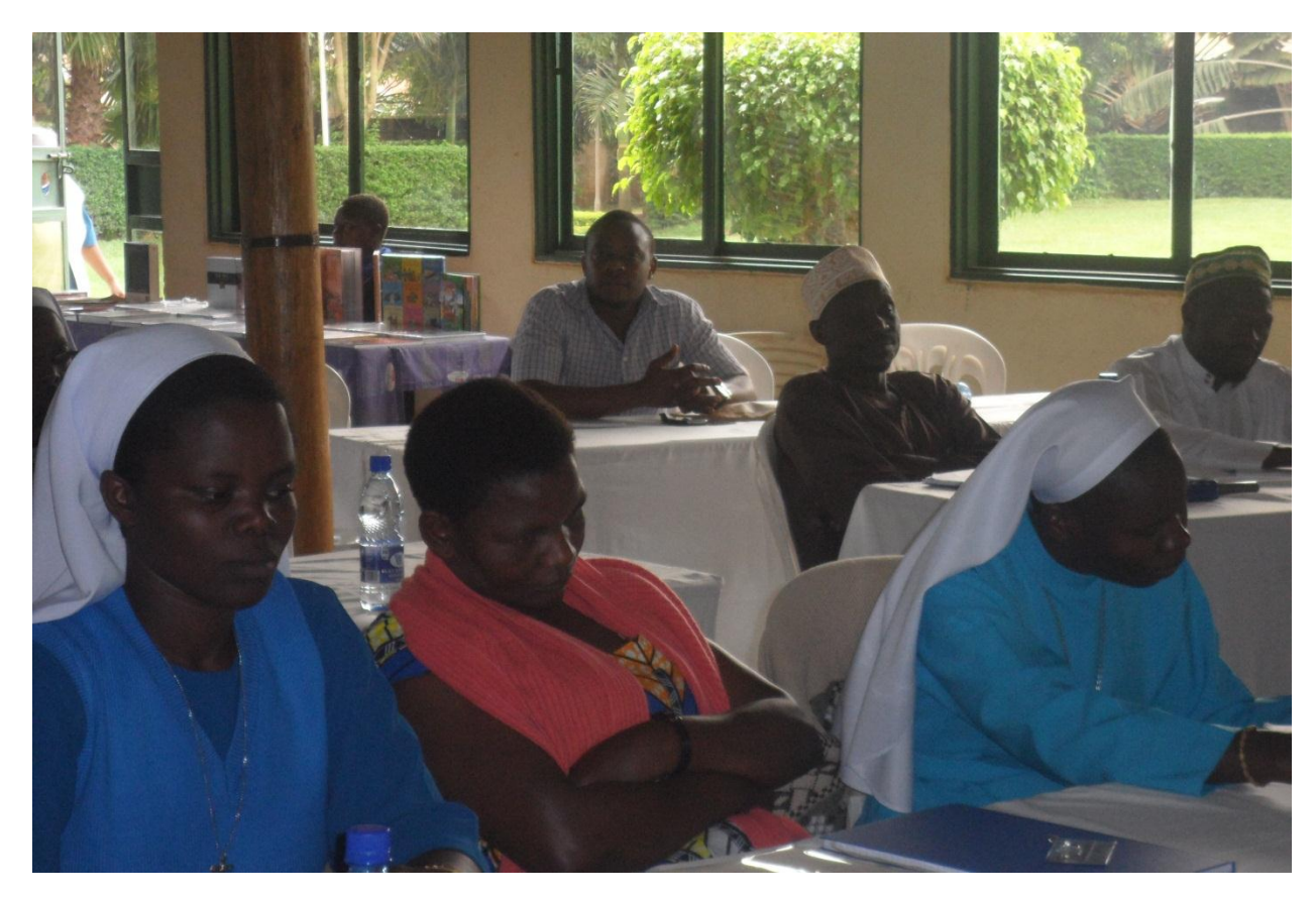
Photo 1: The researcher attending a session during the International Training on Interreligious Dialogue organised by the IRCU.<sup>9</sup>

However, the researcher's lowest point during this training came on the last day of the training. On this day, the participants were taken to visit places of worship of different religions including Namirembe Cathedral (Anglican), Old Kampala Mosque (Islam), the Bahai Temple (Bahai) and Namugongo Martyrs Shrine (Catholic). At Old Kampala Mosque, all female participants were required to veil themselves according to the Islamic tradition before entering the mosque. All female participants obliged and veiled themselves except one who refused arguinng that for her as a Christian, to accept to veil herself would be like accepting to obey the commands of the Muslim God which she could not. She therefore refused to veil herself and consquently did not enter the mosque and chose to stay out as other participants toured the mosque. This incident disappointed the researcher who had thought that after such a resourceful training, the participants had become more tolerant to other religions and were going back home to