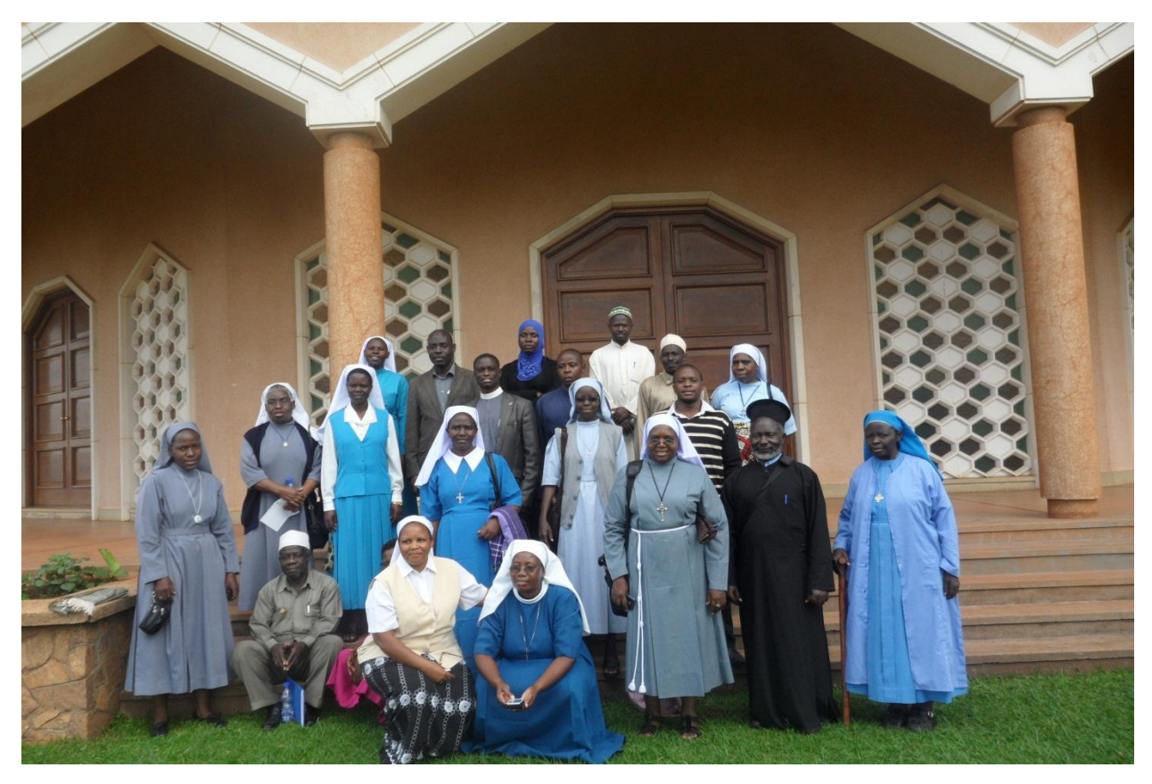
Photo 2: The researcher in a group photo with other participants of the International Training Workshop on Inter-religious Dialogue at the Bahai Temple.

spread a message of love, telerance and peaceful co-existence among their co-religionists. This incident proved to the researcher that inter-religiuos dialogue is a difficult undertaking that requires a lot of patience and that changing the attitudes of some people is not easy. However, what consoled the researcher is that apart from this lady, all the other participants seemed to have grasped the message and the spirit of the training.