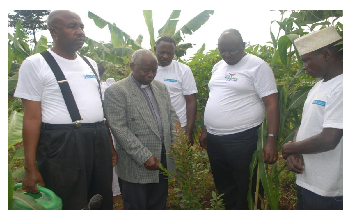
Photo 5 showing Muslims and Christians participating in a tree planting campaign (Dialogue of Action)

This refers to the people of different religions cooperating for the promotion of human development and liberation in all its forms. This happens when people of different religions cooperate and involve themselves in joint projects for a common good or common concern. For example, they can cooperate to build a school, hospital, a road, fight HIV, poverty, injustice, accidents etc. In this form of dialogue, followers of different religions collaborate for the promotion of a common good.