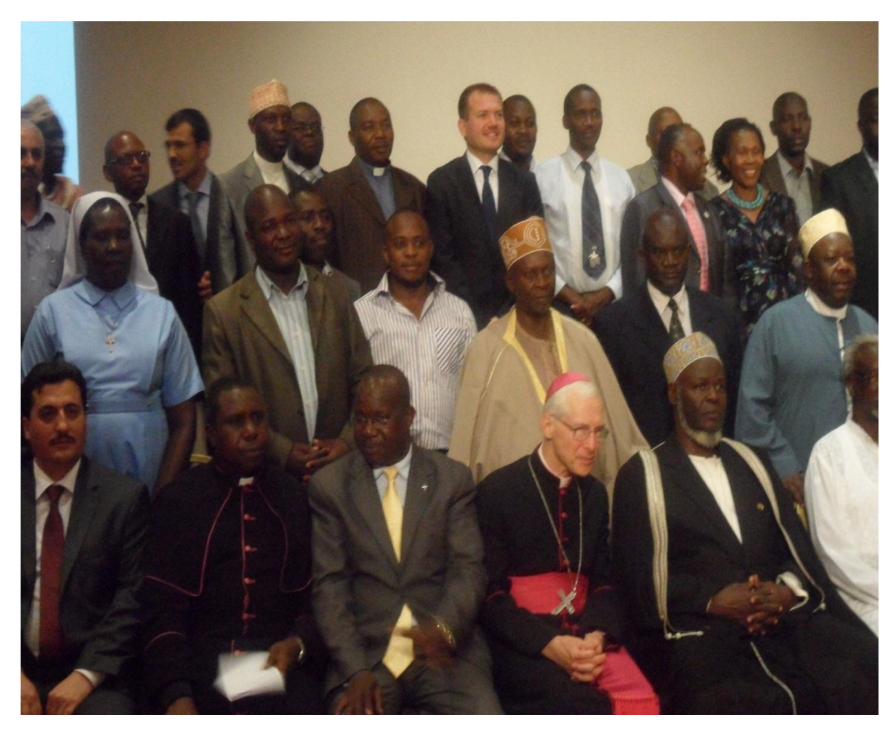
Photo 3: The researcher in a group photo with other guests at the Inter-religious Iftar Dinner organised by The Nile Dialogue Platform on 10<sup>th</sup> July 2014.