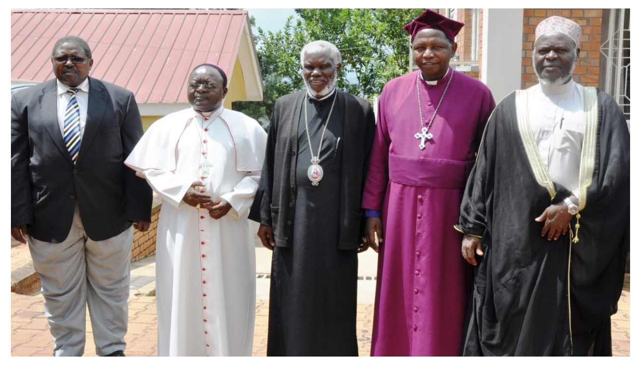
Photo 5: Picture of the members of the Council of Presidents of IRCU as at August 2014.

The IRCU works through the local, regional and national structures of its members. Through this council, religious leaders have strengthened their voice and credibility and are now playing a prominent role in promoting peace and dialogue. The council has become a major voice for the voiceless. It is headed by a Council of Presidents comprising of the leaders of the five member religious groups. Commenting on the relevance of this council, one Muslim respondent said: "Since the creation of IRCU, dialogue and cooperation among people of different religions have increased. We have come to realise that what we share is much more than what divides us".<sup>95</sup>