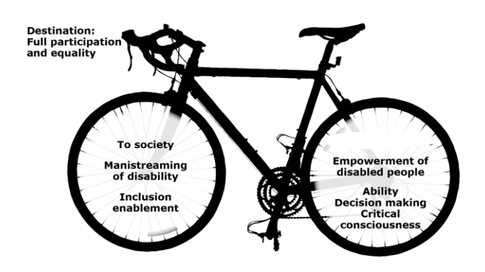
Figure 2: Twin-track approach – bicycle model