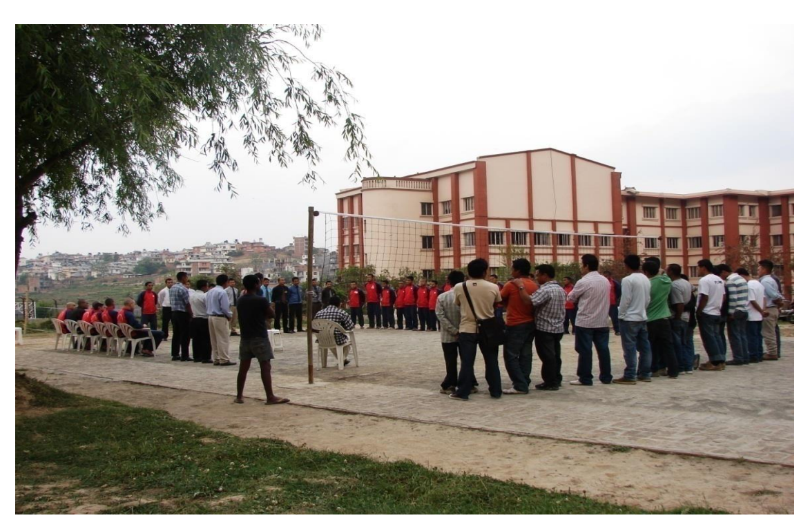
The Premise of Richmond Fellowship Rehabilitation Centre, KTM

Many drug users reported that their families admitted them in this center. However, some of them got admitted by the police, relatives and friends as well. The respondents show both positive and negative feelings to the service that they received there. They were asked, whether they got satisfaction of the services from the center or not, and also requested them to point out the weaknesses of the center. Following picture provided by program manager of this center which shows extra activities of rehabilitated person on this center;