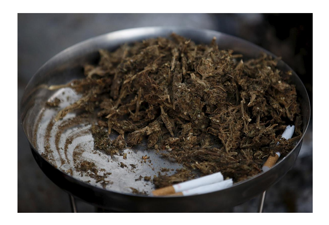
Marijuna for sale in Shivaratri Festival, KTM

In this way, the above discussion of this field study clarifies that there are various cultural practices of using drugs and the drug addicts are also influenced from such practices.