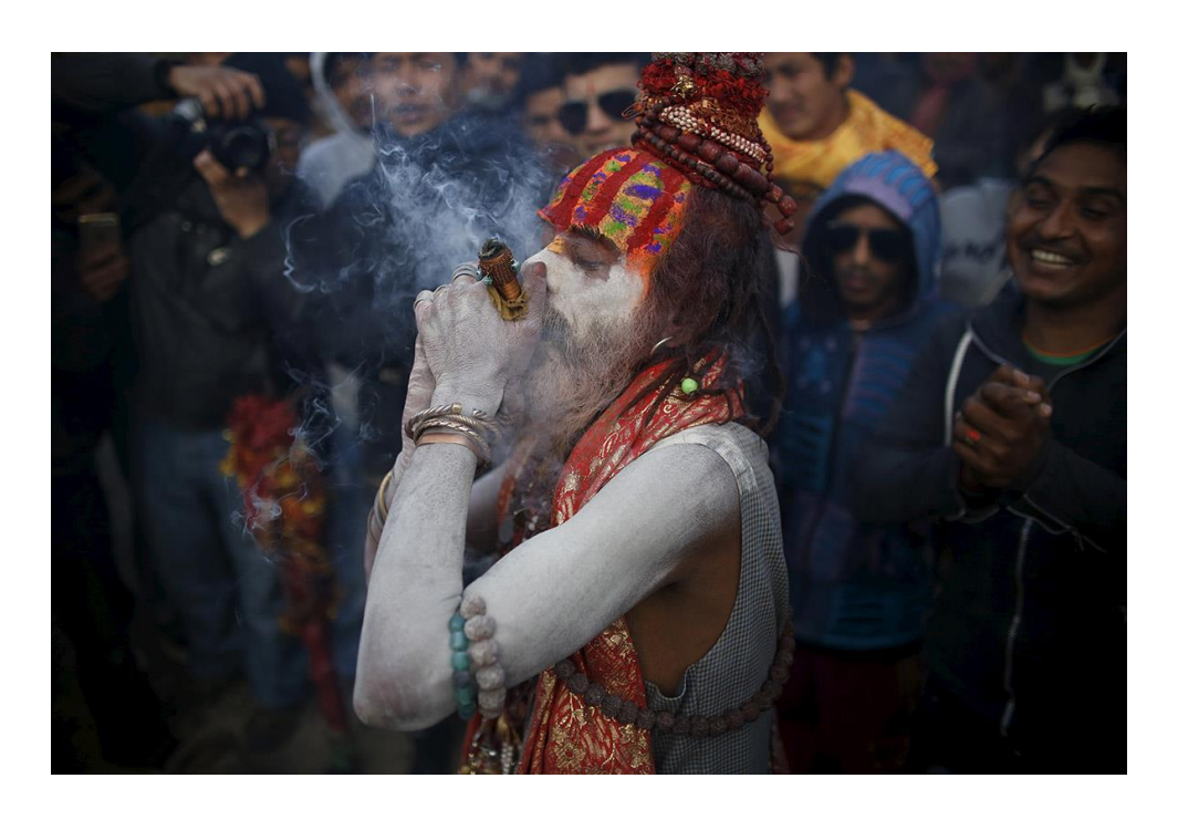
Monk Taking Drug in Shivaratri on Pashupati Temple, KTM