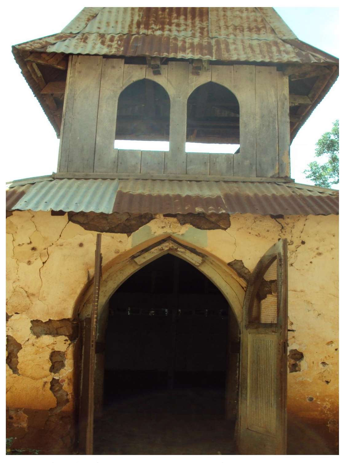
Photograph 2: Old Kidia Church where Rev.Dr.Bruno Gutmann used to conduct Service, now the church is closed for the service but used as tailoring School.