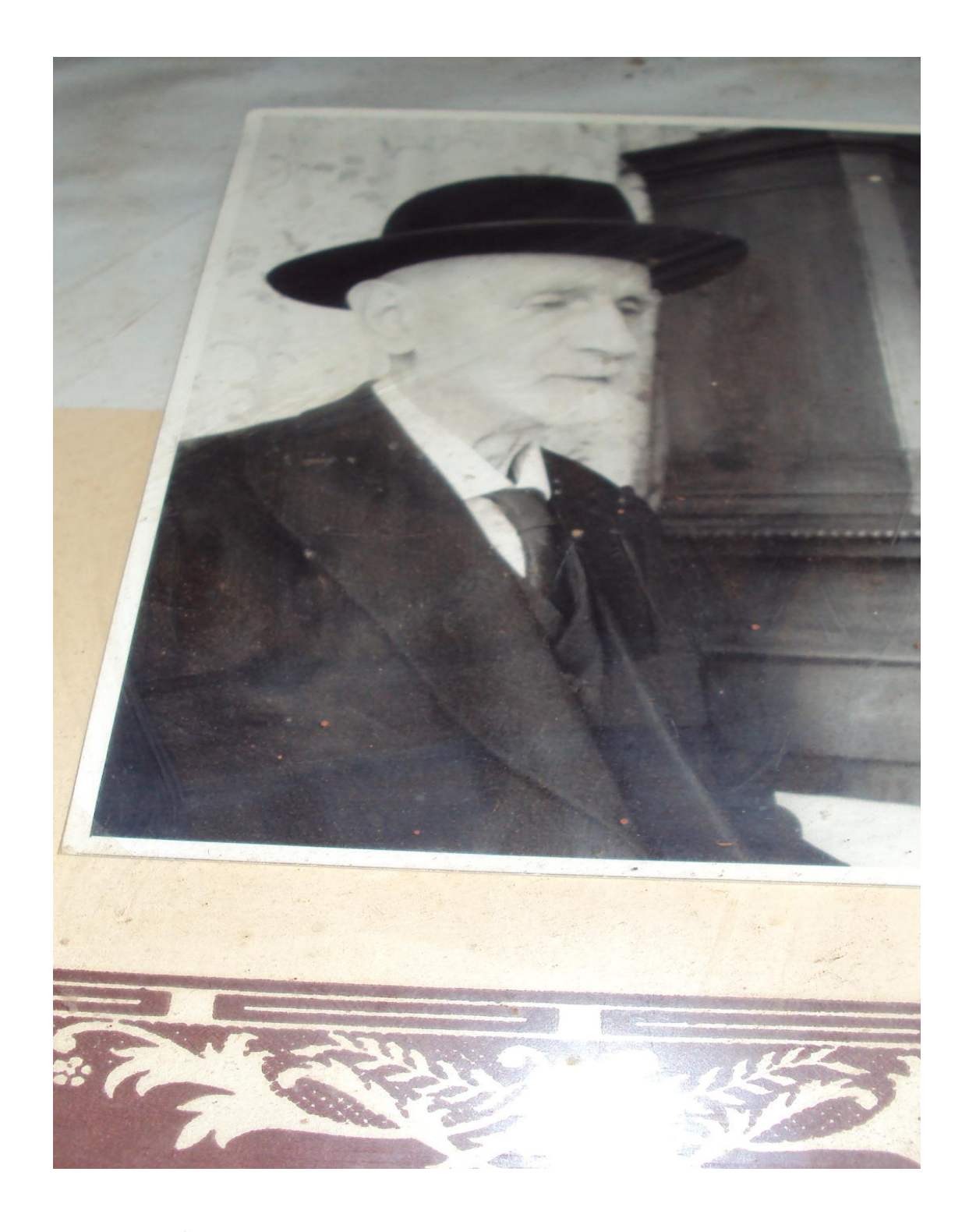
Photograph 6: Gutmann photo