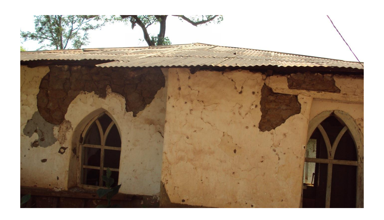
Photograph 3: Other side of the old Kidia Church