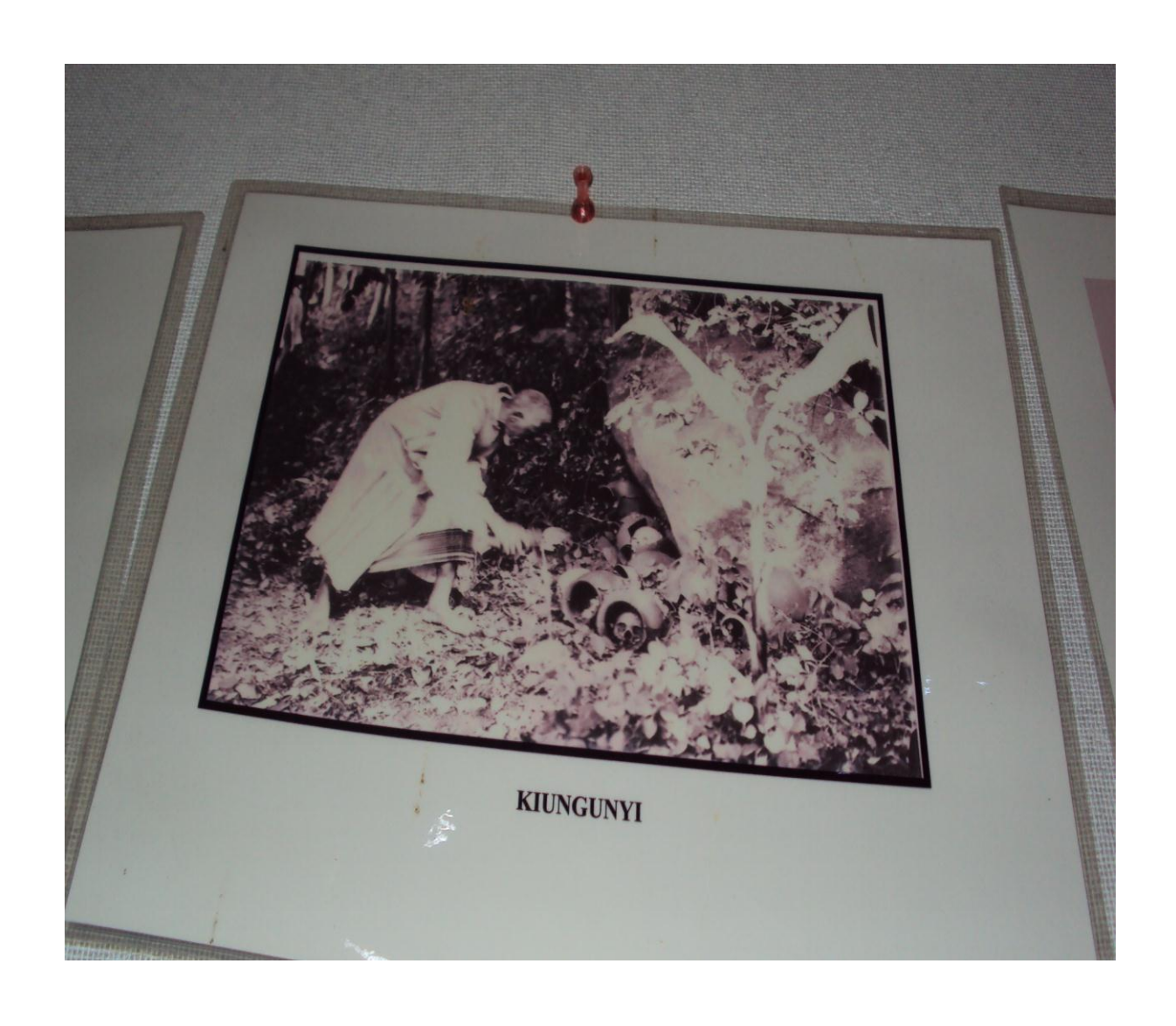
Photograph 8: Shrine area for rituals.