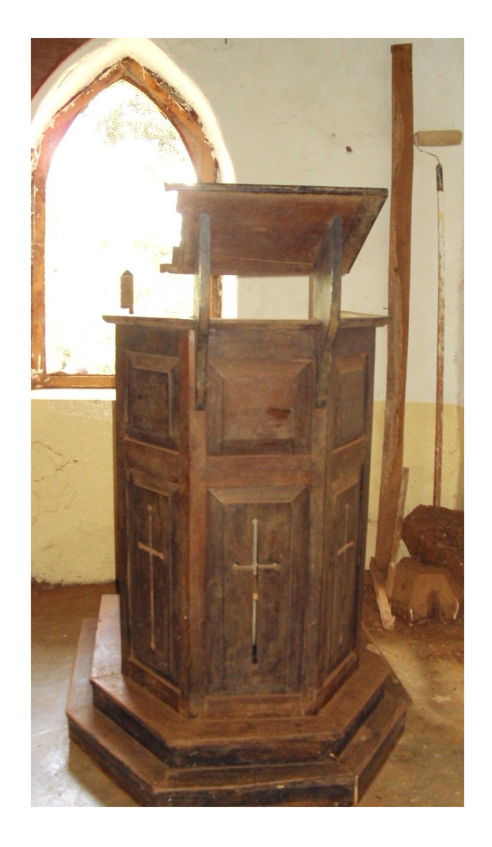
Photograph 5: The pulpit was Gutmann used to preach