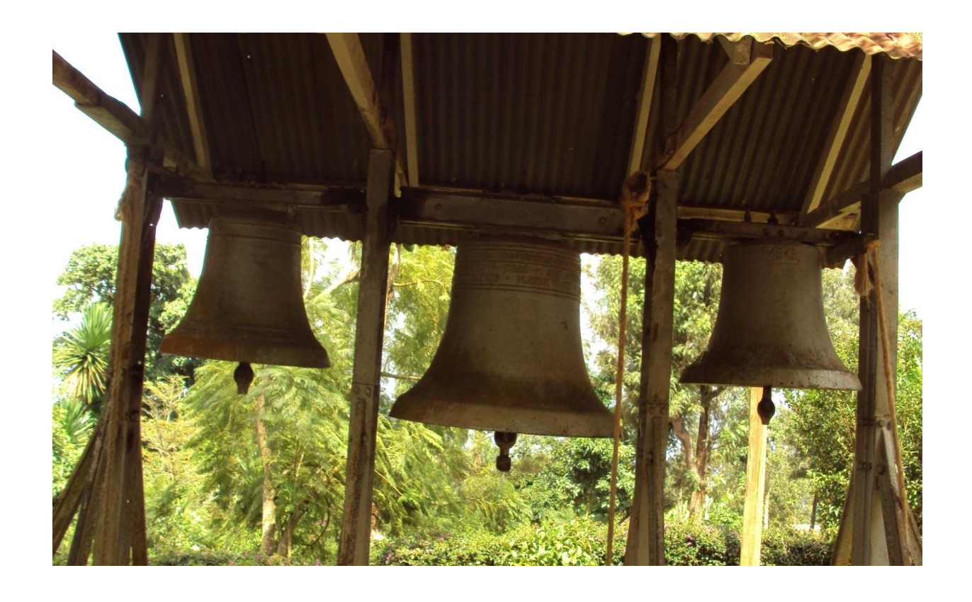
Photograph 1: Bells comes from Germany after the Second World War and it still in Use in the Church.