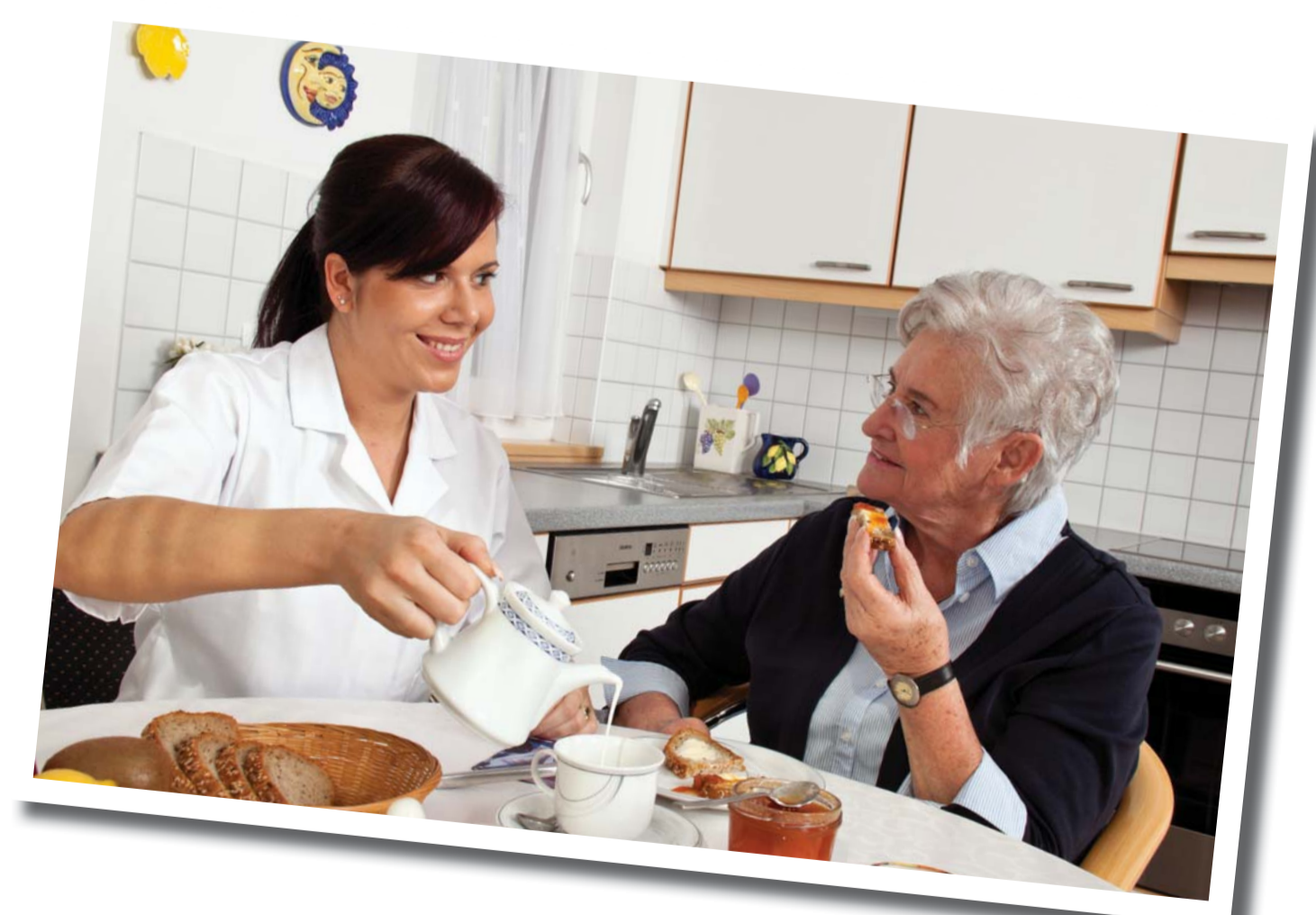
Figure: Staff descriptions of how they can contribute to a calm atmosphere during meals