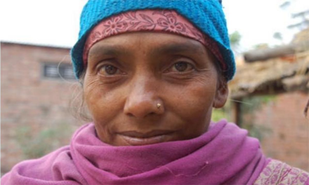
Through peace and reconciliation efforts by HimalPartner in Nepal, women get the opportunity to win back the confidence and self-respect.