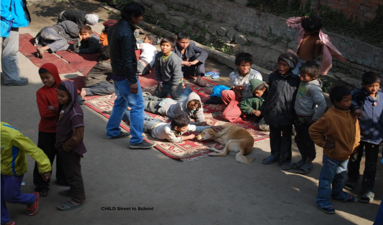
CHILD Street to School