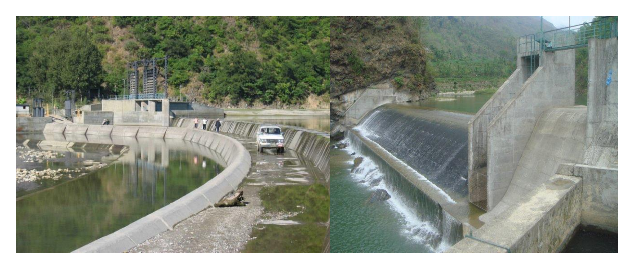
UMN and HP Contribution to the Development of Hydropower in Nepal and Its effect on the environment

Master's Thesis Submitted for the Degree in Diakonia and Christian Social Practice