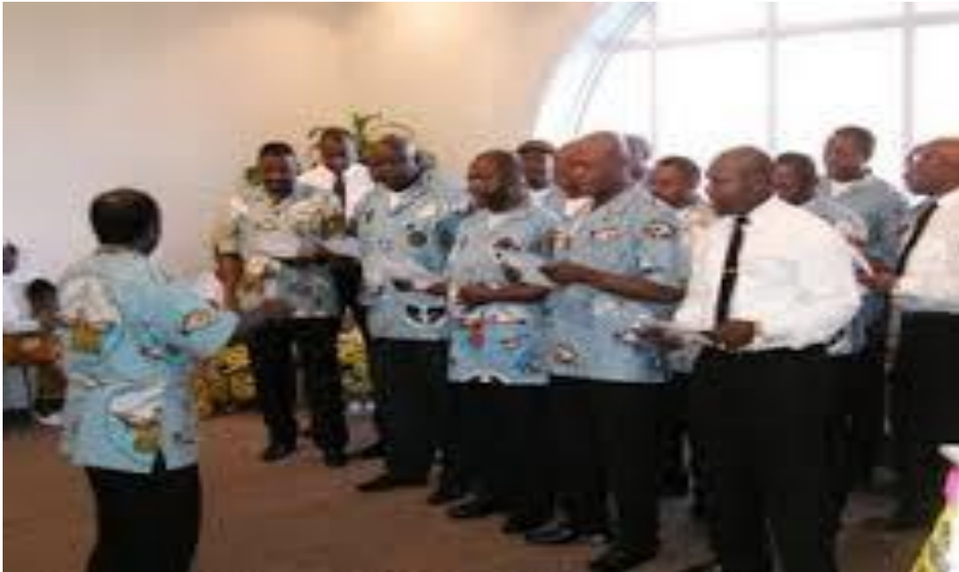
The Christian Men Fellowship Group, Kumba-Cameroon.

In Cameroon the Church is called upon to be a watchman for society; hence it cannot distance itself from societal concerns. Most often, the symbolic acts of the Church are carried out through its social arms, for example, the Christian Men Fellowship (CMF). The CMF thus challenges human oppression, subordination, human right abuse and marginalization, and seek to restore human freedom, dignity and self esteem (The challenges of NGO in Anglophone-Cameroon, p. 4).