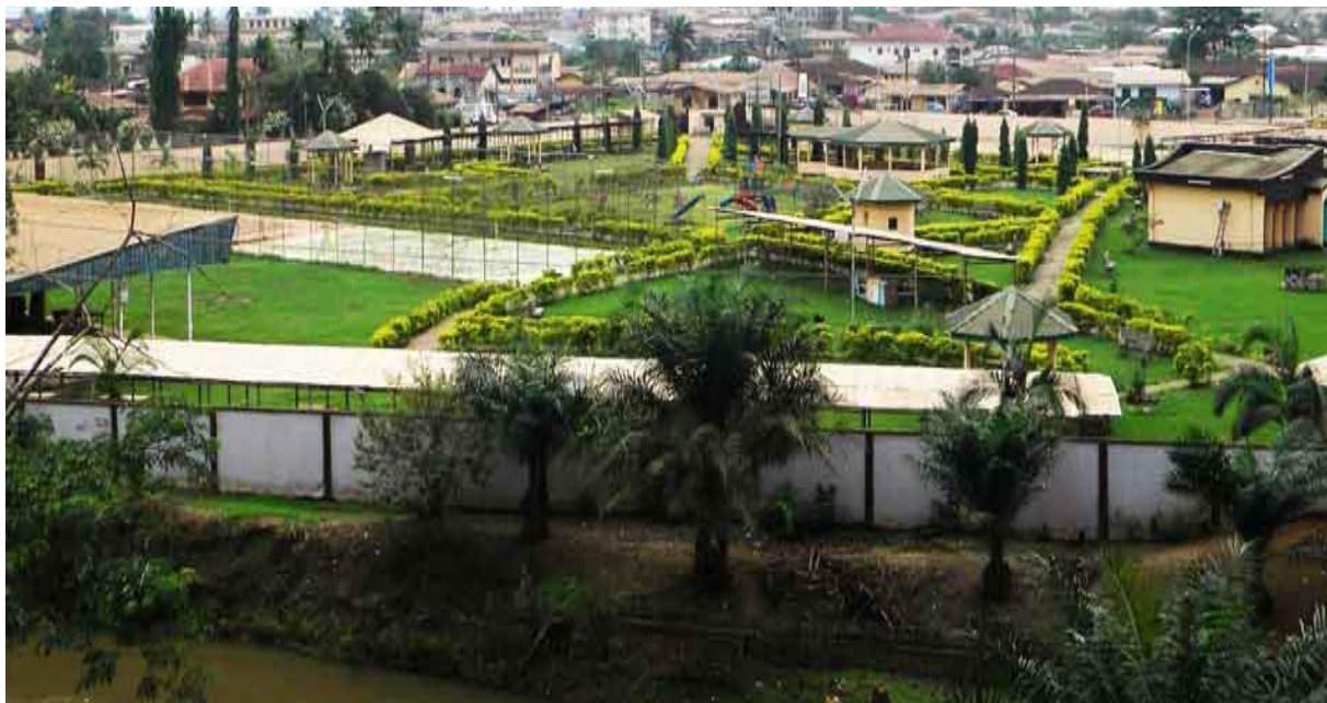
The Amusement Park, Kumba.

Below is a brief description of the town of Kumba in which the study was carried out.