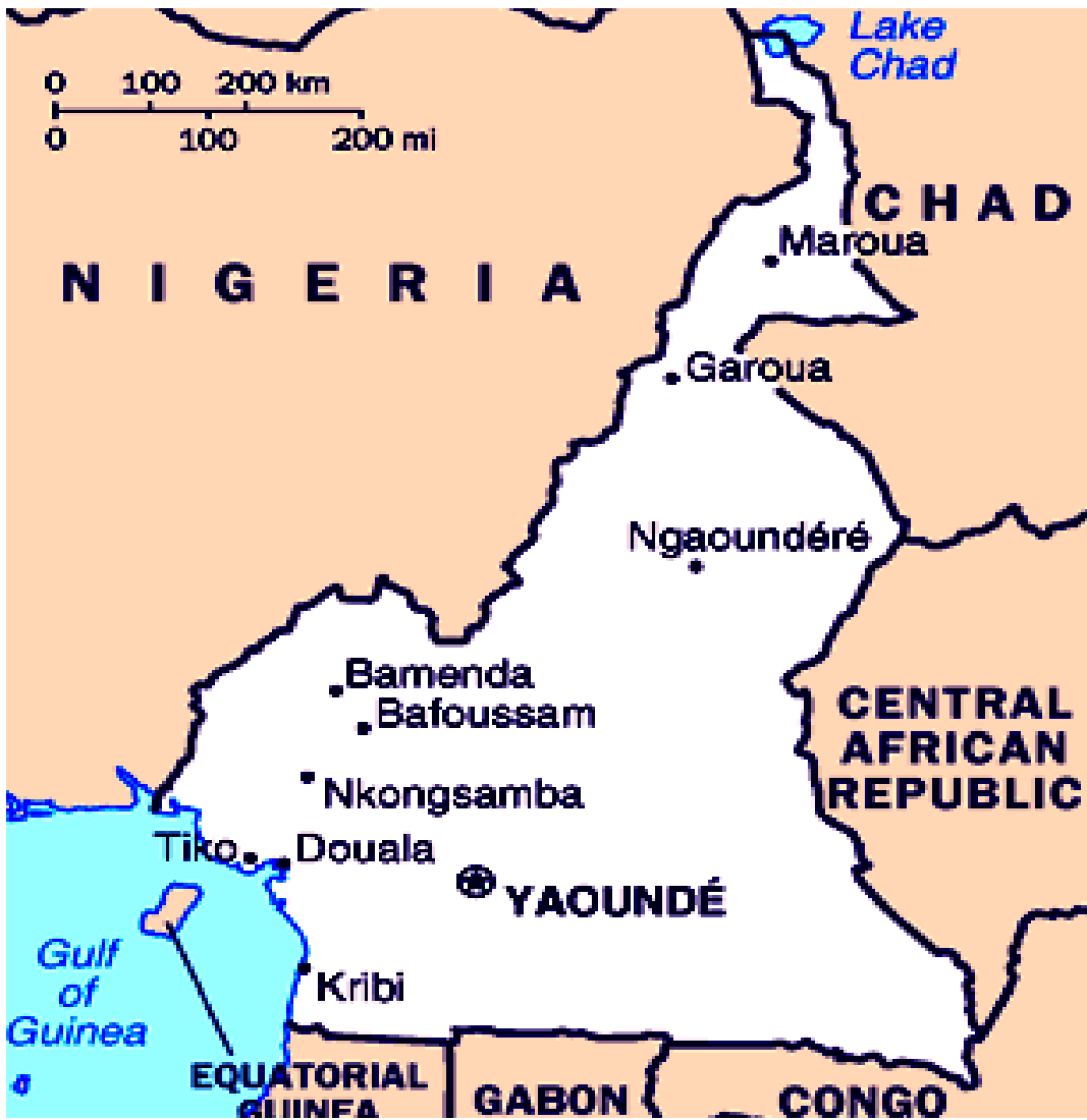
Map of Cameroon

Cameroon is in West Africa, and situated north of the equator on the Gulf of Guinea covering a land area of 465,400 square kilometers (World Road Statistics, 2006). Its estimated population by the U.S. State Department