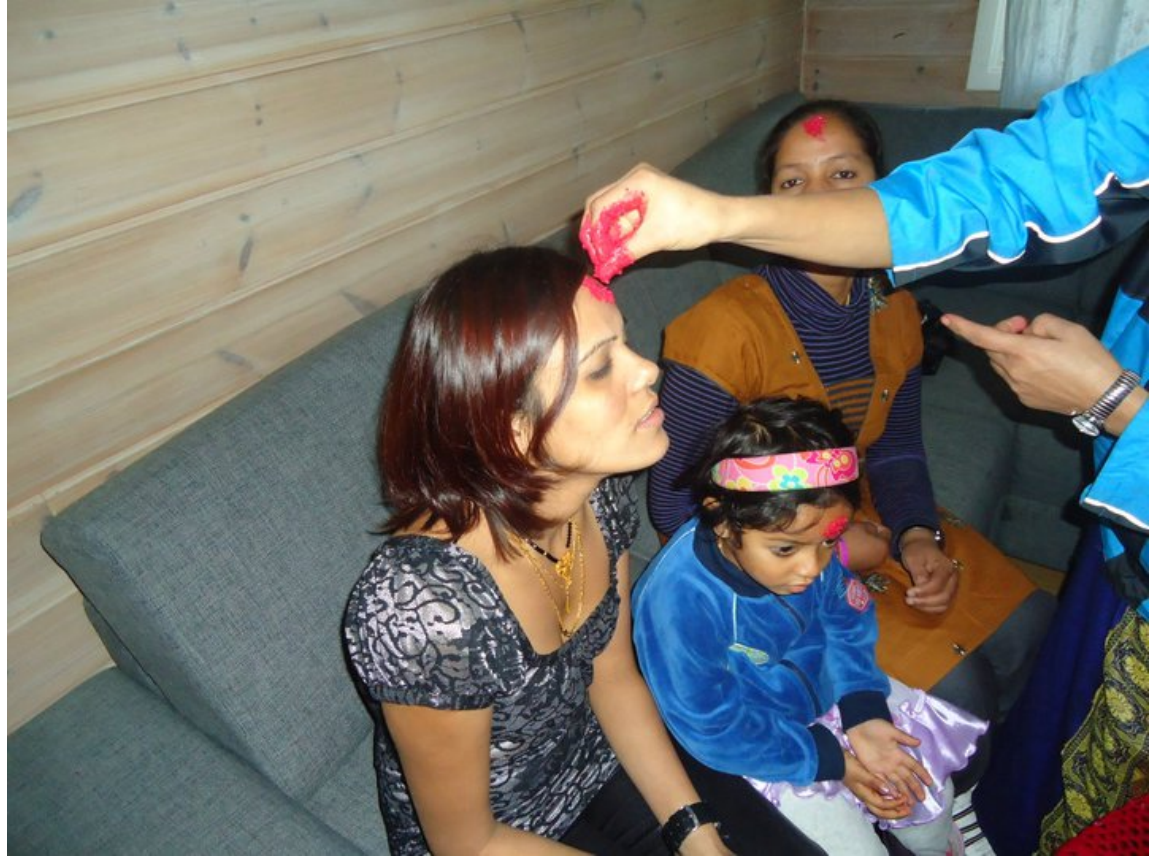
Figure 5: Dashain Ceremony: Younger getting Tika during Dashain Festival from the Elders

During Dashain , the elders bless they youngers with Tika in their forehead (Figure 5). Tika is a symbol of blessings. Every elder blesses—every younger so that the youngest one gets many wishes and blessings from the elders. It is very common to go to relatives' house to get blessings. In Dashain festival, anyone can go to the elder person of a community without any pre-information. To go to an elder's house, is taken as a symbol of respect. Usually, the "Nepali Speaking Bhutanese", an organization of the refugee, organizes Dashain ceremony. They get together in the ceremony, the eldest person of the community blesses—the younger with red tika and red powder.