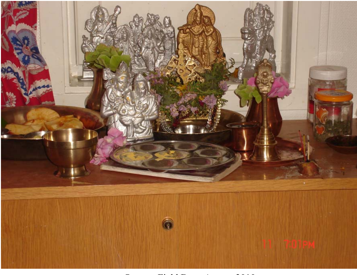
Figure 6: Symbols of Hindu God and Goddess

Most of the older people pray to God every morning and evening before taking morning and evening meal. They have portraits, photos and some praying materials in the corner of their bedroom (Figure 6).