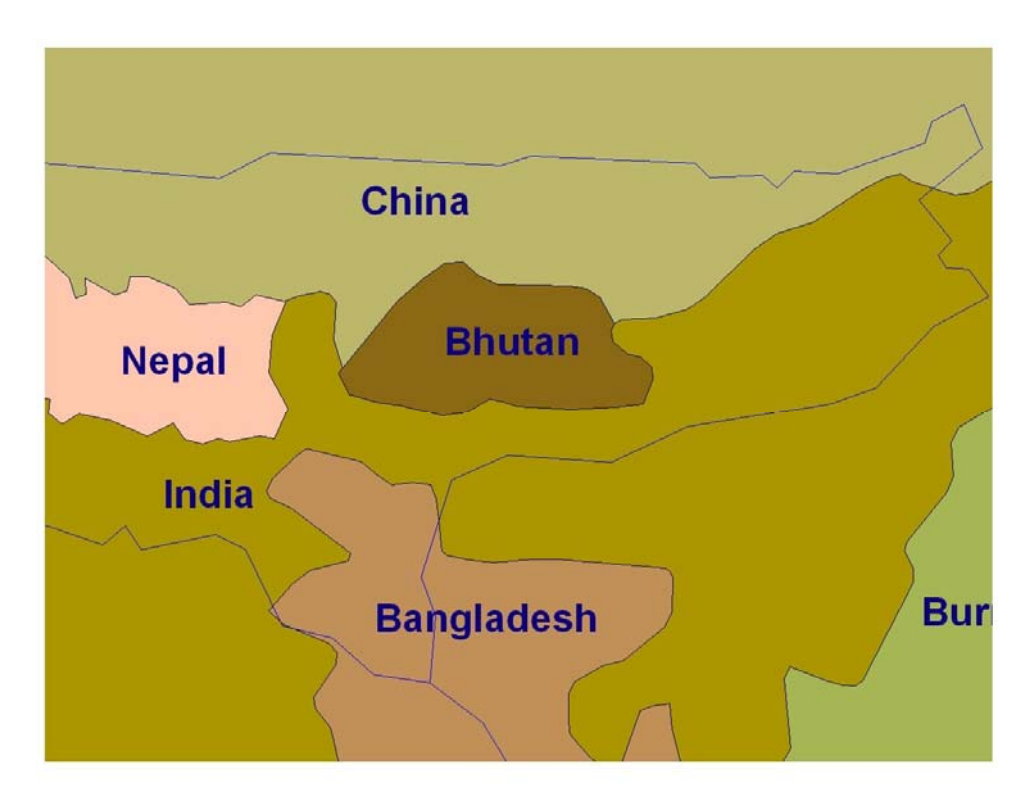
Figure 1: Location Map of Bhutan

His Majesty Jigme Dorgi Wangchuck (from 1972 to 2006), reformed some psedo-feudal systems by abolishing serfdom, redistribution of land, reform in taxation system. He also established power segregation by establishing executive, legislative and judiciary body of the state. The fourth king (present) is Jigme Singye Wangchuck who took a decentralization policy and assigned all the executive powers to a council of ministers elected by the people in 1998.